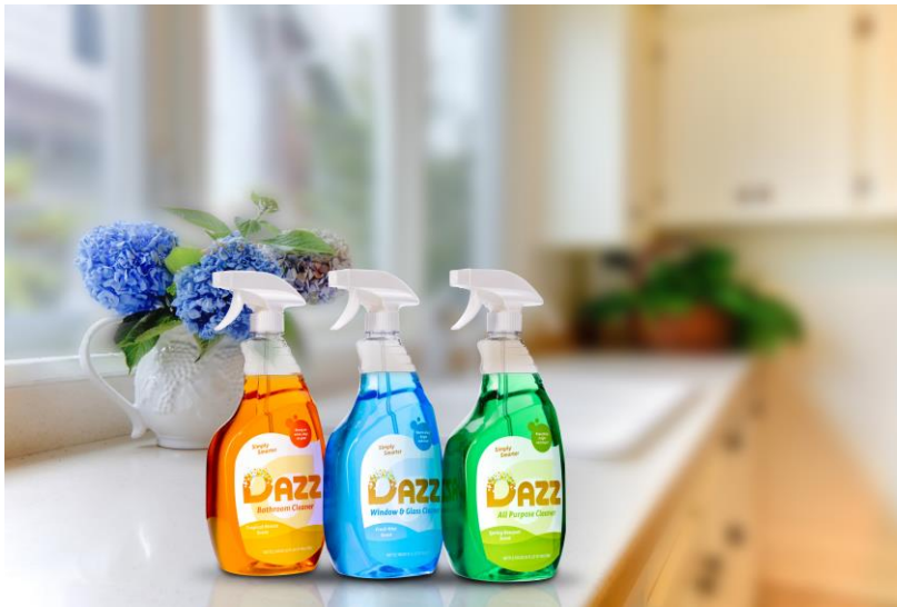
Caption: Self-activated DAZZ spray cleaners shown ready for use.

DAZZ tablets are available in packets that occupy little space for easy storage in a kitchen drawer or almost anywhere. The impact of the DAZZ system can be to eliminate millions of tons of plastic and other packaging waste, reduce carbon creation, electricity use and highway transport issues associated with the manufacturing and distribution of pre-filled spray cleaners that are mostly water. Americans are not the only ones to discard a massive quantity of empty spray cleaner bottles annually; the problem is international with growing global affluence.